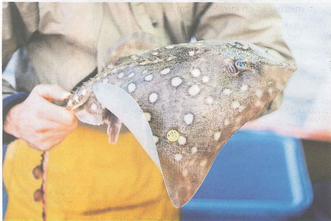
The aim of the project is to help support a more sustainable, long-term shark and ray fisheries

Twitter: https://twitter.com/Sharkbywatchuk