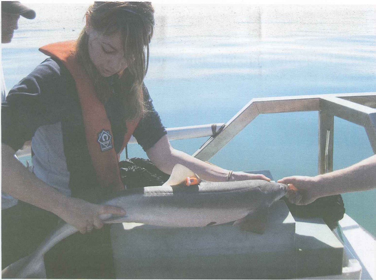
Shark By-Watch UK hopes to harness the expertise and knowledge of southern North Sea fishermen from the under 10m fleet